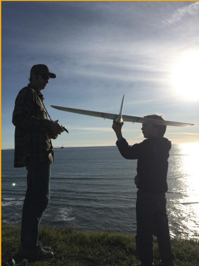
The Weasel-TREK's compact, lightweight airframe offers non-intimidating slope performance to pilots of all skill levels.