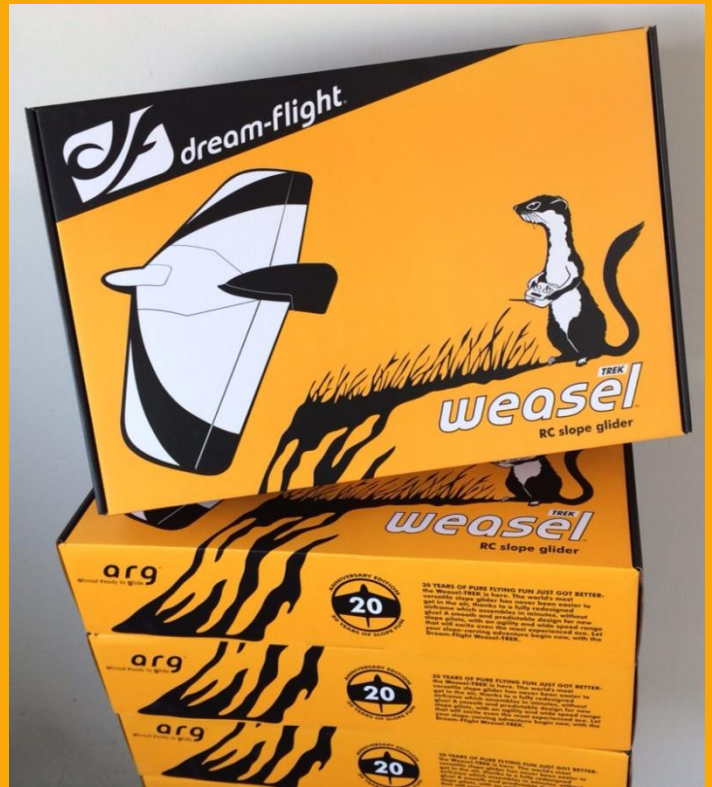
Ready for retail - colorful and informative packaging is ready to stand out on the hobby shop shelf.